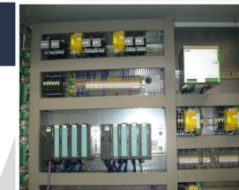
SPS / control cabinet S7