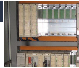
SPS / control cabinet S5